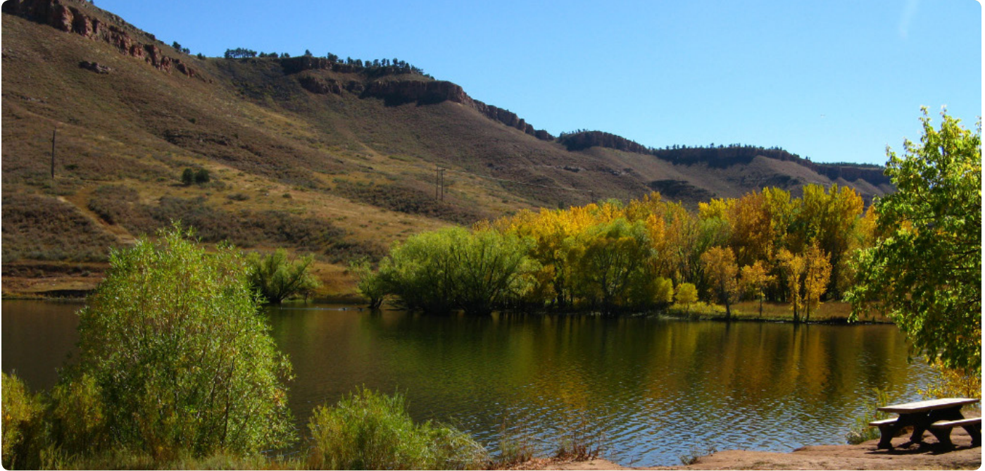
Flatiron Reservoir