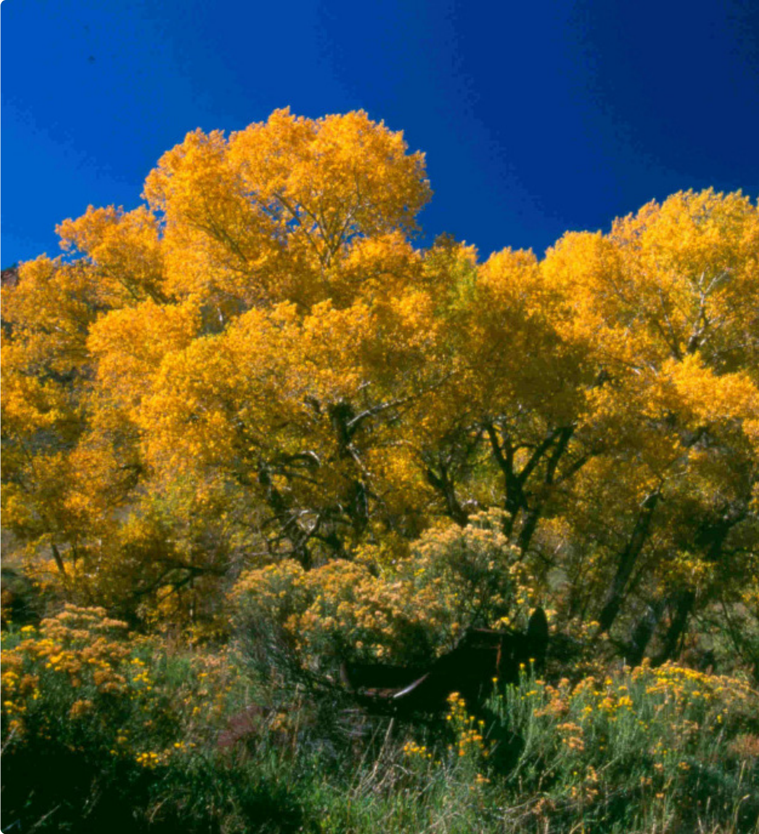
Chimney Hollow Open Space