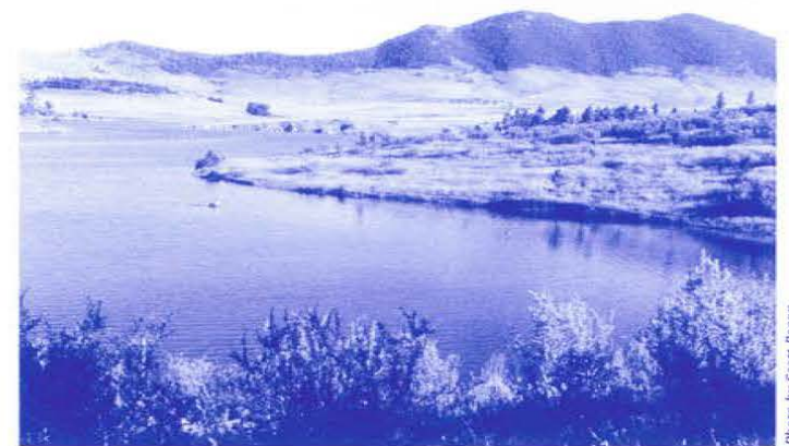
A view of Pinewood Reservoir from Ramsay-Shockey Open Space.