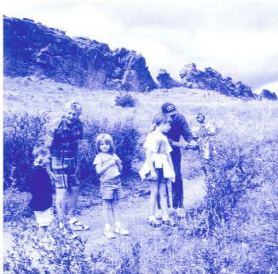
Hikers of all ages enjoyed the opening of the Devil's Backbone Nature Trail.

In previous years, the Open Lands Program acquired almost 400 acres of one of the most dramatic Front Range hogbacks – the Devil's Backbone. In 1999, a three and a half mile nature trail was constructed to allow Larimer County citizens to get a first-hand look at the prominent rock outcrop of Dakota Sandstone west of Loveland.