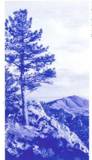
One of the many spectacular views from the Audra Culver Trail.

The end of the Millennium coincided with the completion, in December 1999, of the Audra Culver Trail. The 282-acre Hughey Property, an expansion to Horsetooth Mountain Park Preserve, was acquired in 1998 as a buffer to the Regional Park Preserve. Hosting a variety of wildlife including deer, mountain lion, black bear, and Abert's squirrel, the Hughey Property also provides important habitat for colonies of the imperiled mottled dusky winged butterfly. When designing and constructing the trail, this important butterfly and wildlife habitat as well as the spectacular views, were considered. The trail was opened to the public in May, 2000.