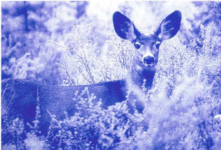
Deer are important inhabitants of Larimer County Open Lands

Good land stewardship is a high priority for the Larimer County Open Lands Program and we will continue to involve citizens in the resource management planning process. Through the development of solid resource management plans, the Open Lands Program can continue to provide Larimer County citizens with a quality of life – wide, open landscapes, plentiful wildlife, and recreational opportunities – they have chosen for today and for the future.