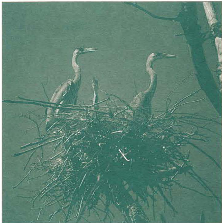
Nesting Great Blue Herons

All of these studies provide important information, and the Open Lands Program will participate in more of these in the future.